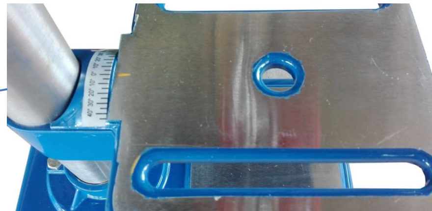
Adjustable tilting worktable