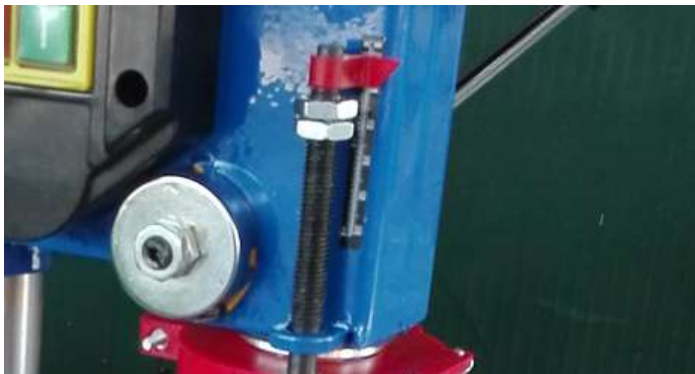
Drilling depth adjusting system