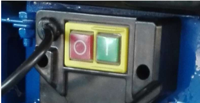
Safety switch with minimum tension coil